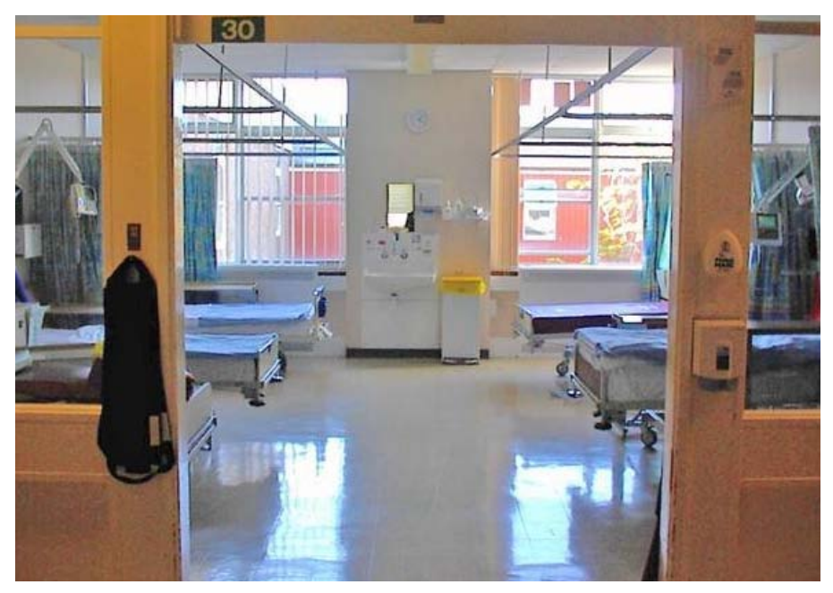
Single-sex bay well separated from the corridor by robust partitioning As long as toilets are immediately adjacent and there is no need to pass through opposite-sex areas this would meet the guidance for separating the genders.

All partitions separating men and women's areas should be full-height, rigid and fixed to the building structure.