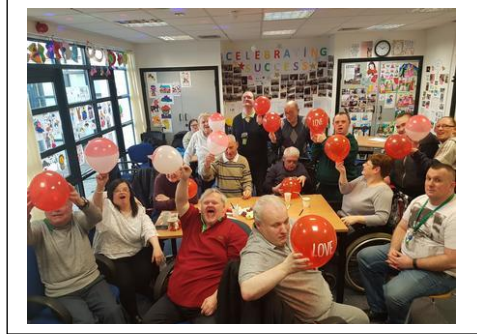
Living Ambitions held a Digni-Tea event