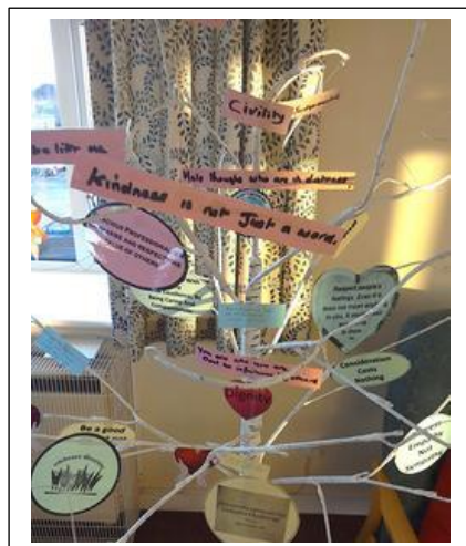
Five Fields Court's Digni-Tree

As a reablement worker and Dignity Champion for North Yorkshire