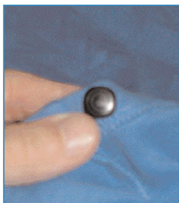
RFID button attached to item of clothing

The 11mm buttons are easily attached to clothing and each can be programmed to store up to 200 characters. This can include the person's name, unit, room number and any other information that they may wish to keep private. Some residents may have the MRSA infection which requires that their clothing be washed separately from others. Skin-related issues, such as eczema or an allergy to biological washing powder can be also included on the button. Members of staff do not need to keep asking residents for this information which maintains the resident's dignity and their privacy. Each button is reusable and can be easily reprogrammed if there is a change in a resident's circumstances.