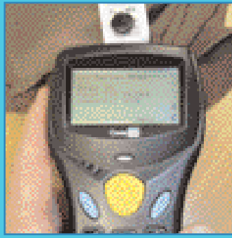
Button attached to the care label of clothing, being scanned to identify the owner