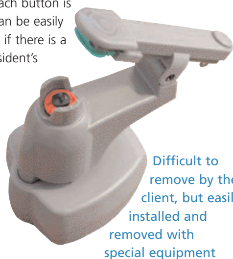
Difficult to remove by the client, but easily installed and removed with special equipment